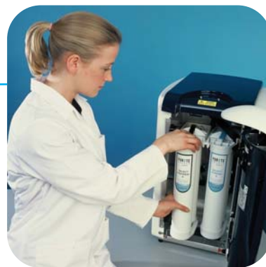
Model featured: Select HP