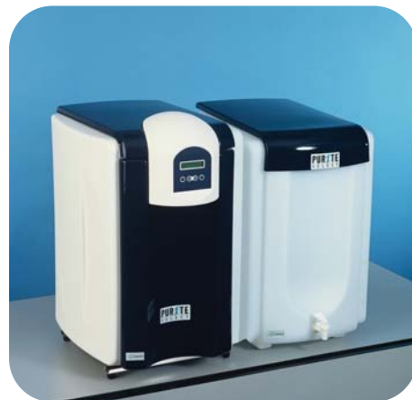
Model featured: Select Analyst with external tank